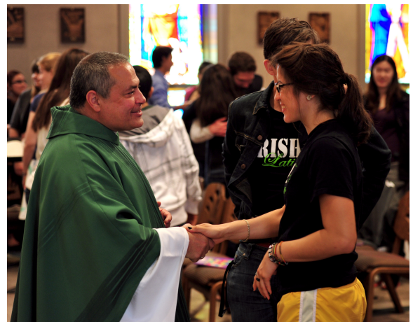
Fr. Joe celebrating Mass with the students at the University of Notre Dame.

1 http://www.catholicnewsagency.com/news/so-what-are-these-missionaries-of-mercy-actually-doing-90852/ .