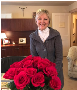
A friend of the Center bringing flowers on the feast of Our Lady of Grace, Feb. 7, 2017

I wish you a summer filled with refreshment and peace.