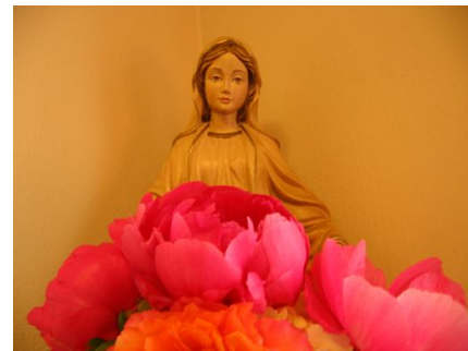
Grand Re-opening Day, May 18, 2020

From all of us at Our Lady of Grace Catholic Spirituality Center, from our hearts to yours, I wish you and those you love a very Merry Christmas and a Happy and Healthy New Year!