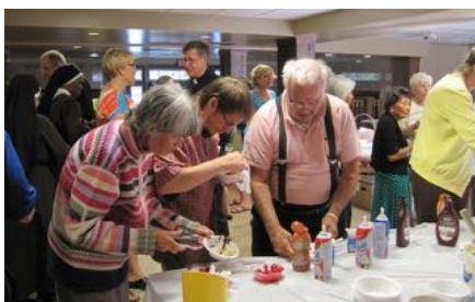
Ice Cream Social 2014