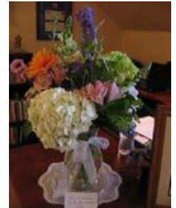
Tenth Anniversary Bouquet Gifts from Two Friends of the Center