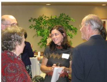
Wine and Cheese Reception 2011