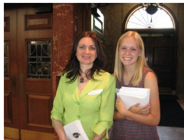
Holy Hour Greeters 2014