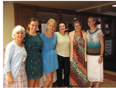
Ice Cream Social Volunteers 2013