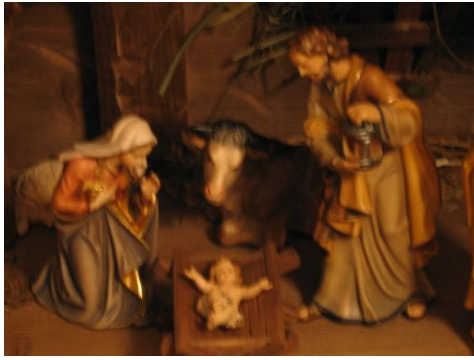
Gift to the Center 2013