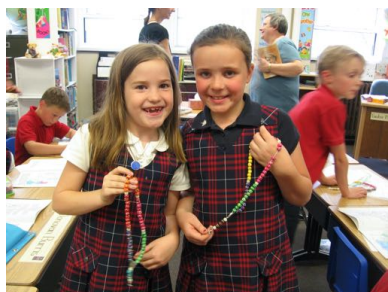
Second Grade Rosary Workshop 2015