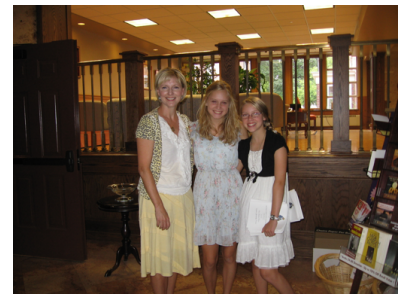
Holy Hour 2012 – Young Greeters with their Mom