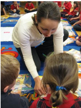
Our Lady of Grace Rosary Workshop 2013

To priests, who exercise a paternal role over Ecclesial Communities, may Saint Joseph help them love the Church with affection and complete dedication, and may he support consecrated persons in their joyous and faithful observance of the evangelical counsels of poverty, chastity and obedience. May he protect workers throughout the world so that they contribute with their different professions to the progress of the whole of humanity, and may he help every Christian to fulfill God's will with confidence and love, thereby cooperating in the fulfillment of the work of salvation.