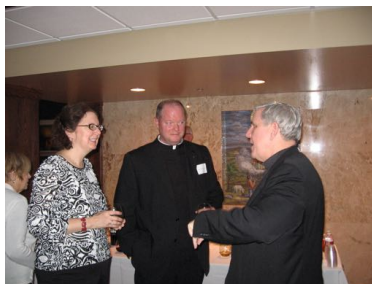
Archbishop Jerome E. ListECKI Wine and Cheese Reception 2010 and 2011