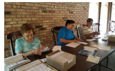
Newsletter Mailing Volunteer Team 2017